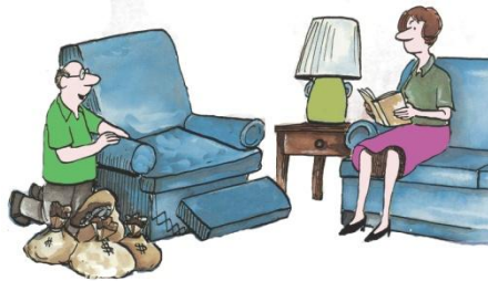
"So far I've found $80,000 under the cushion."

Your plan may offer other options as well, including the possibility of taking a lump-sum distribution. The best option for you depends on your individual situation, including your (and your spouse's) age, health, and other financial resources.